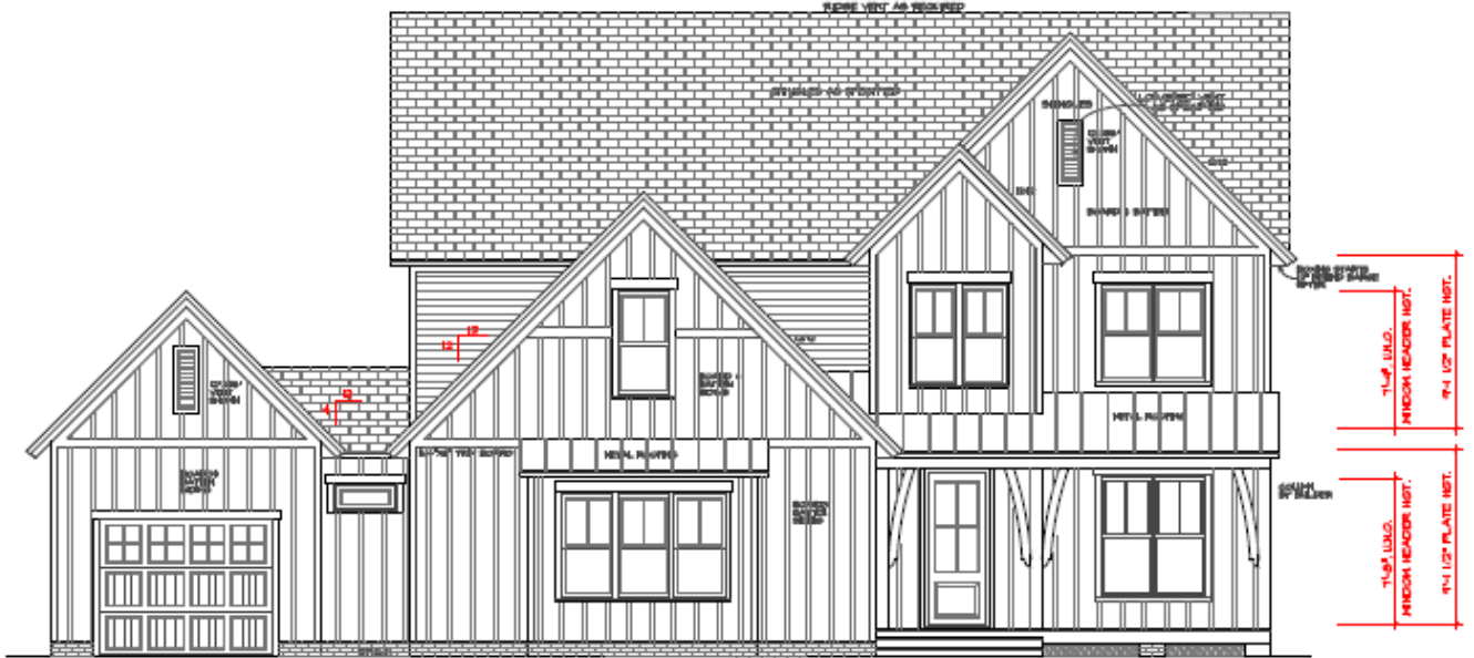
OPTIONAL SIDE-LOAD 3 CAR ELEVATION SCALE 1/4" = 1'-0"